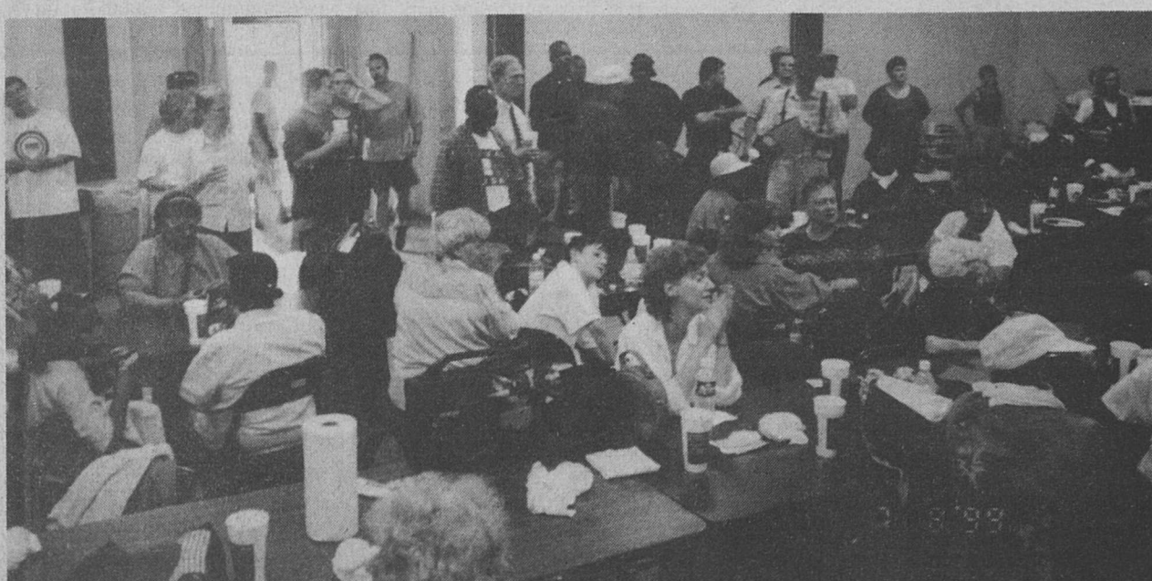
Citizens and officials of Eagle Lake and surrounding communities opened their arms to the 200 plus passengers and crew who had been aboard Amtrak's Sunset Limited when it derailed just outside Eagle Lake last Thursday morning.

According to Glaizer, Eagle Lake firemen spent 180 man-hours on the accident in addition to the hours spent by their Ladies Auxiliary. "The main (Continued on Page 5)